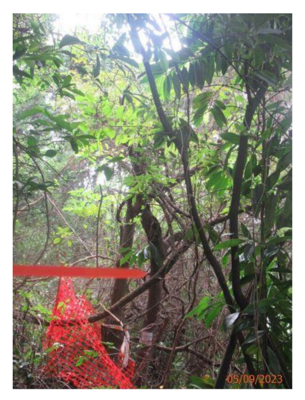
Photo 1 - Tree protection zone for preserved plant species of conservation importance